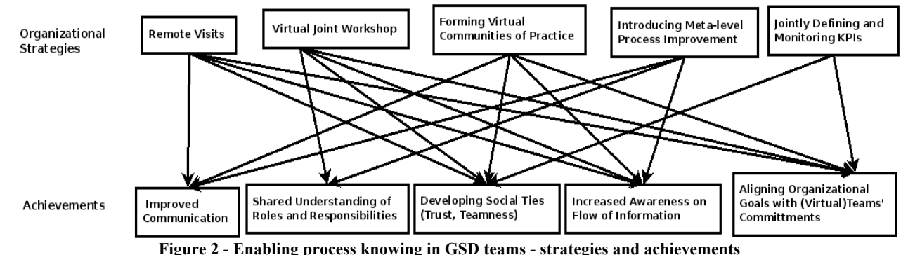
Figure 2 - Enabling process knowing in GSD teams - strategies and achieveme

review requirements and proposed solutions. The meta-level practice is to start a project by explicitly expecting collaborative engagements between usability team and architects to analyze requirements, to maintain discussion between stakeholders on proposed solutions, and refining technical solutions, and finally having clarification phase for development team to understand proposed inputs (i.e., requirement and design solution) for kicking off a project.